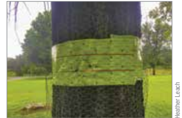
Figure 4. A banded tree covered in chicken wire to prevent mammal and bird bycatch.

any tree, but we recommend only banding trees where SLF is abundant. You can use either sticky bands or a funnel-style trap. Sticky bands may be purchased online or from your local garden center. Push pins can be used to secure the band. While some bands may catch adults, banding trees is most effective for nymphs. Be advised that birds and small mammals stuck to the bands have been reported. To avoid this, you should cage your sticky bands in wire or fencing material wrapped around the tree. Alternately, try reducing the width of the band, so that less surface area is exposed to birds and other mammals. Both of these methods will still capture SLF effectively. To eliminate the risk of catching birds and mammals, you can use funnel-style traps that consist of mesh wrapped around the tree that leads into a container to trap SLF (Figure 5). Some companies may be producing these traps commercially, or you could also make your own. The mesh (e.g., plastic netting) should be wrapped around the entire circumference of the tree and funnel into a container (e.g., inverted peanut butter jar or plastic bag) with a hole in the lid to allow SLF nymphs and adults to pass through. Read more