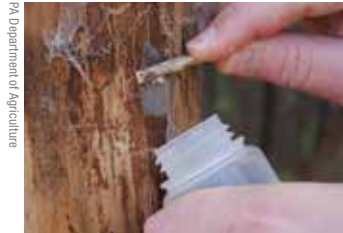
Figure 3. Scraping SLF egg masses from a tree.