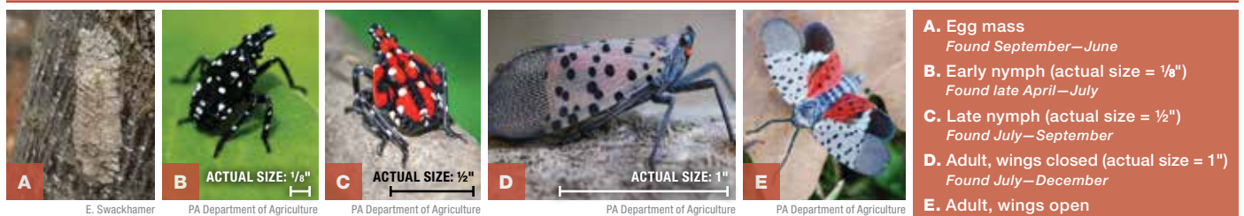
Figure 1. The life stages of SLF, including an egg mass on a tree.

and are active until winter. This is the most obvious and easily detectable stage because they are large (~1 inch) and highly mobile. Adults have black bodies with brightly colored wings.