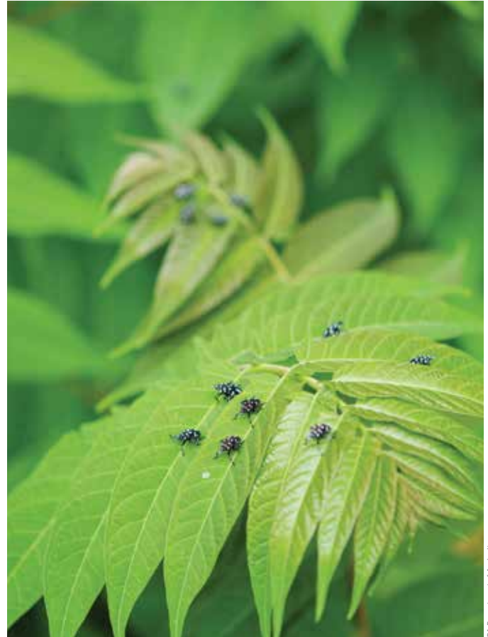
Figure 6. Early instar SLF feeding on the invasive plant tree-of-heaven.