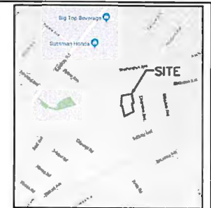
Location Map Sheet 1 - 100'