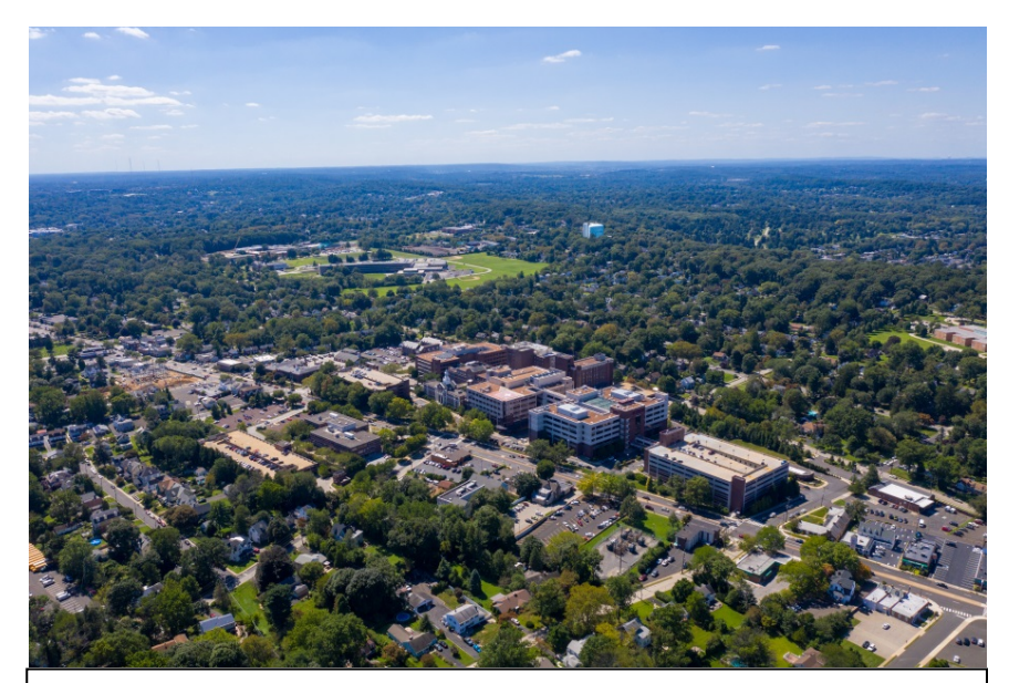
Abington Township Vista (over Old York Road).

A Thriving, Equitable Community. The people who comprise the Abington community will be diverse, inclusive, friendly, welcoming, engaged and interconnected. Newcomers will be embraced and empowered by the community. Strong transportation networks, including rail and bus transit, that serve diverse user groups will provide a range of travel choices. Neighbors will look out for one another and foster a strong sense of civic engagement and pride, enhanced by volunteerism. The employment base, fiscal health, public health, and education system of the community will be sound, include innovative schools, and