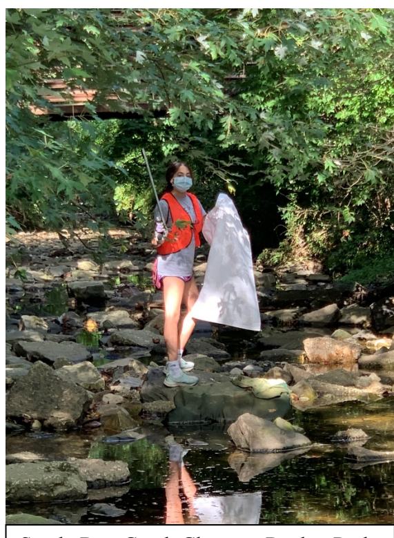
Sandy Run Creek Cleanup, Roslyn Park

will be easy, practical and safe. Transportation choices will serve as viable alternatives to the personal automobile, and will make it even easier for residents, employees and visitors to travel around Abington, and from Abington to Philadelphia and other destinations in the metropolitan area. Sustainability and environmental resilience