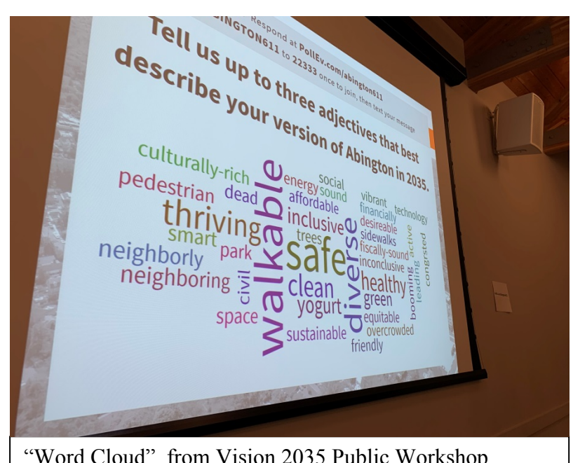
"Word Cloud", from Vision 2035 Public Workshop, Crestmont Community Center