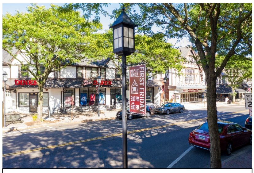
Keswick Village and Theater

and social events and will flexibly adapt to the needs and desires of the community's ever-changing population. The township's and community's formal and informal networks will foster a business-friendly environment that promotes economic development.