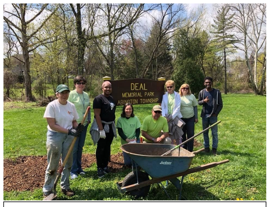
Tree City USA Volunteer Event

be supported by the township's land use, public and fiscal policy.