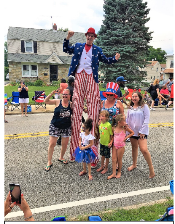
4<sup>th</sup> of July Celebration, Glenside

and demonstrate the well-maintained and historic nature of many of Abington's homes and residential neighborhoods. All neighborhoods will be safe, pedestrianand bicyclist-friendly, will include generous shade tree canopy and will have good access to parks and open space.