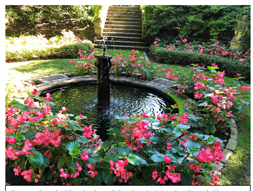
Pennsylvania Horticultural Society's Meadowbrook Farm

Thriving businesses with abundant entertainment, arts & leisure, and dining options will beckon residents and visitors. Mixed uses and transit-oriented. pedestrian-oriented development will strengthen activity near the township's train stations and main streets, and will support activity during the day, evening and weekends. The township's ample parks and recreation system will undergo further accessibility and functional enhancements, with greater stewardship of its natural areas. The system will continue to host a variety of sports, hobbies, exercise opportunities,