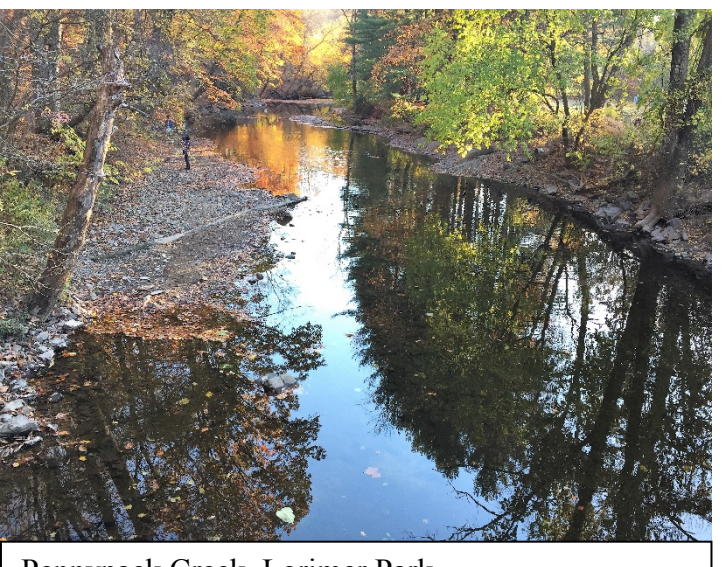
Pennypack Creek, Lorimer Park

will feature prominently in the township's programs and policies, helping Abington adapt to a changing climate while serving as a sustainability and resilience leader, setting an example which other communities can learn from. Enhanced landscaping, greenery and aesthetic standards will reinforce Abington's visual attraction and sense of place.