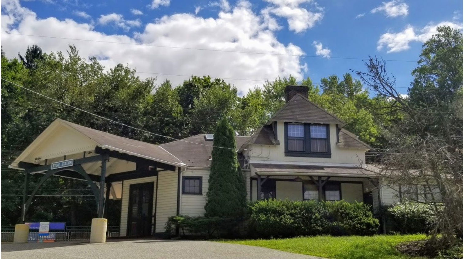
The Rydal Train Station (originally known as "Benezet"), constructed 1883.