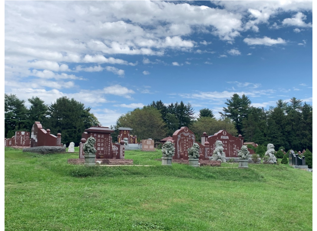
Hillside Cemetery, Roslyn