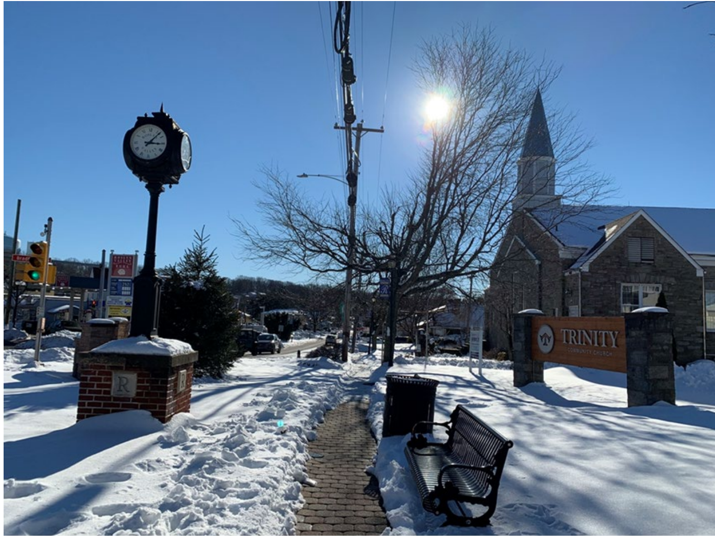
Easton and Bradfield Roads, Roslyn.