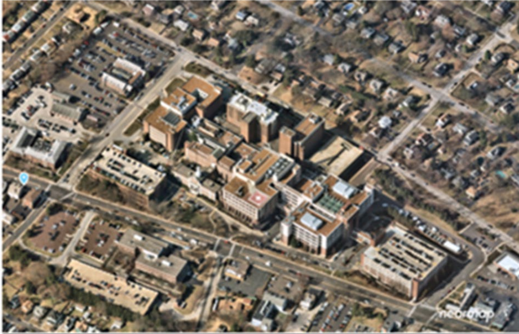
Abington Jefferson Hospital occupies more land than any other land use in Abington Village today