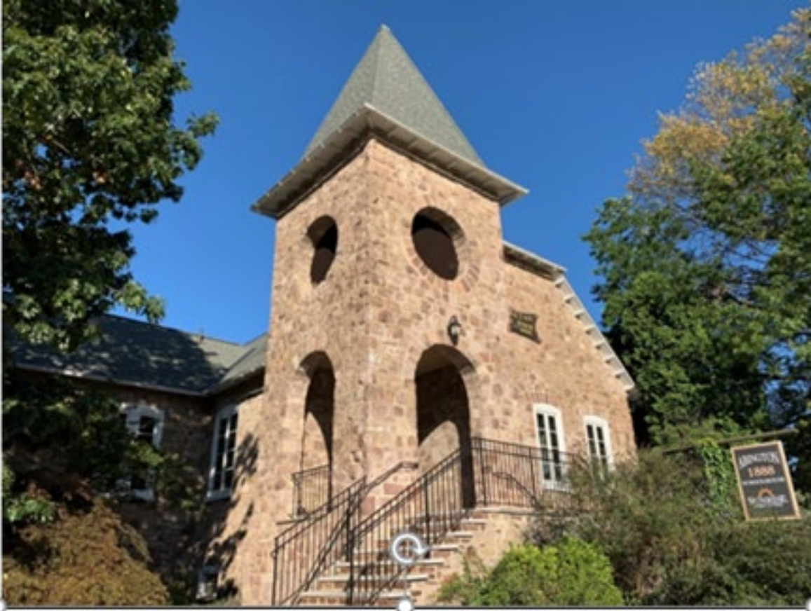
Former Abington High School (1888), Susquehanna Road (in Abington Village area)