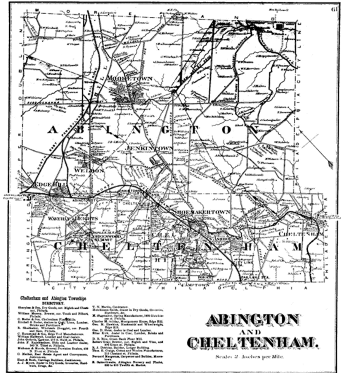
From Montgomery County and Pennsylvania map (1871), Published by G.M. Hopkins & Co.