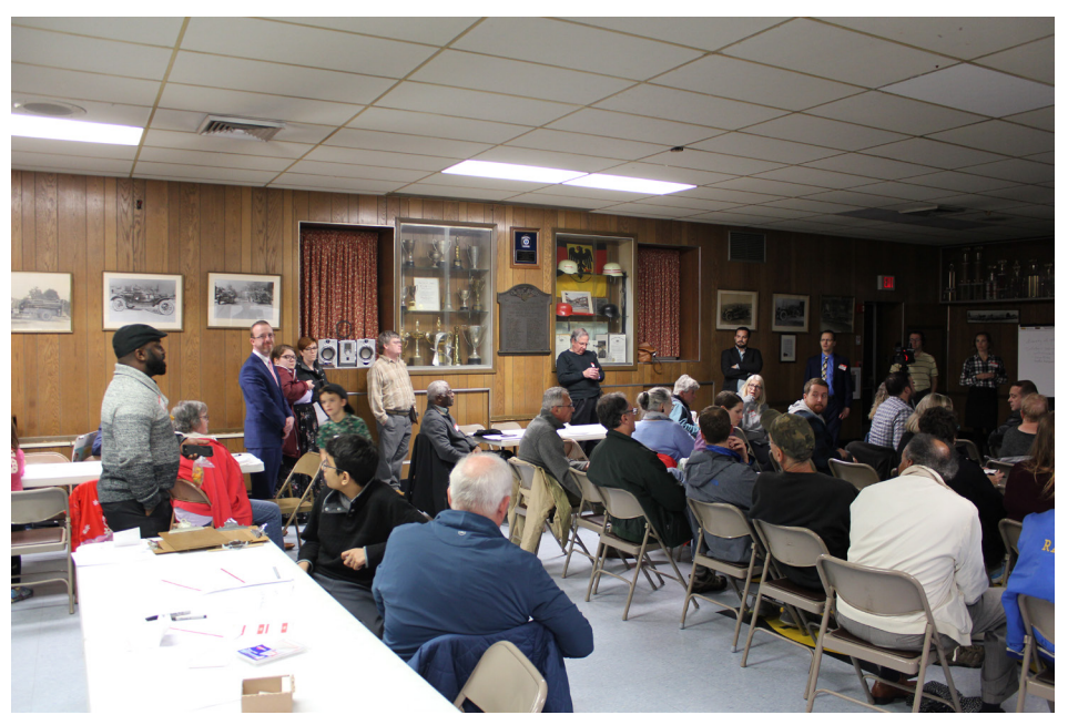
\label{thm:local_process} \textit{ for Vision 2035 began with four public workshops in neighborhoods} \\ \textit{ around the township.}

Vision 2035 was prepared by the Comprehensive Plan Development Team, in coordination with Montgomery County Planning Commission. The Team consisted of nine appointed citizens, meeting in consultation with township staff and the township's planning consultant, Montgomery County Planning Commission. Citizen members of the Team brought a range of backgrounds and planning experience, and hold a variety of civic interests. The Team deeply values the importance of public participation. For this reason, public outreach was conducted at key points in the planning process using a variety of techniques, including a survey and public workshops held at multiple sites. Vision 2035 serves to update the township's last comprehensive plan, adopted in 2007.