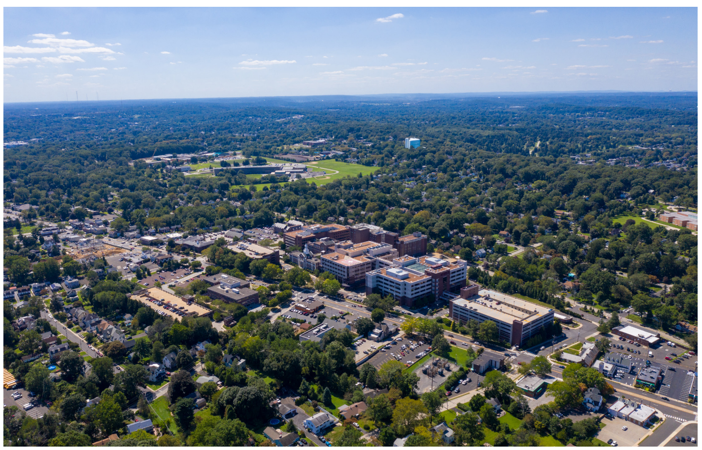
Abington Township vista (over Old York Road).