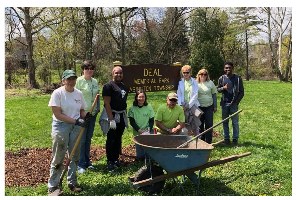
Tree City USA volunteer event.

Municipal government will be open and transparent, allowing all township residents to easily participate in and inform themselves about the processes and actions of the township's elected and appointed officials. Municipal