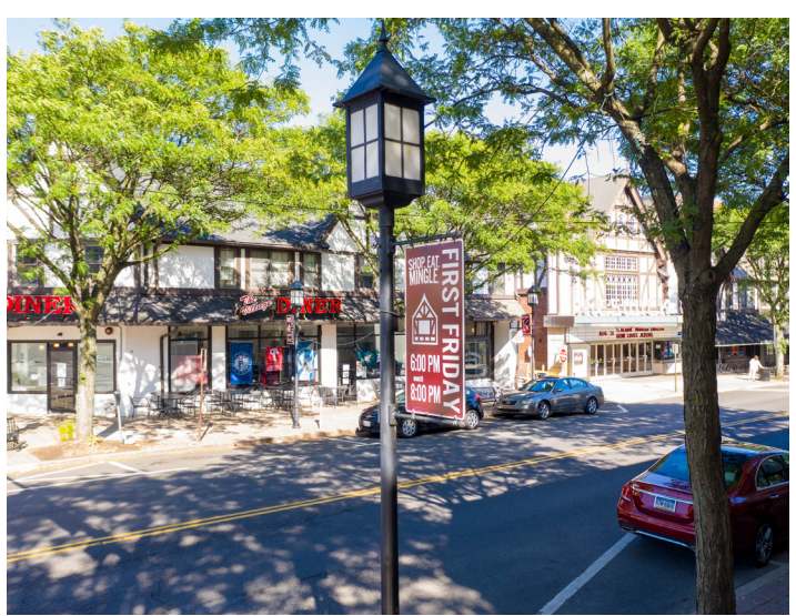
Keswick Village and Theater.