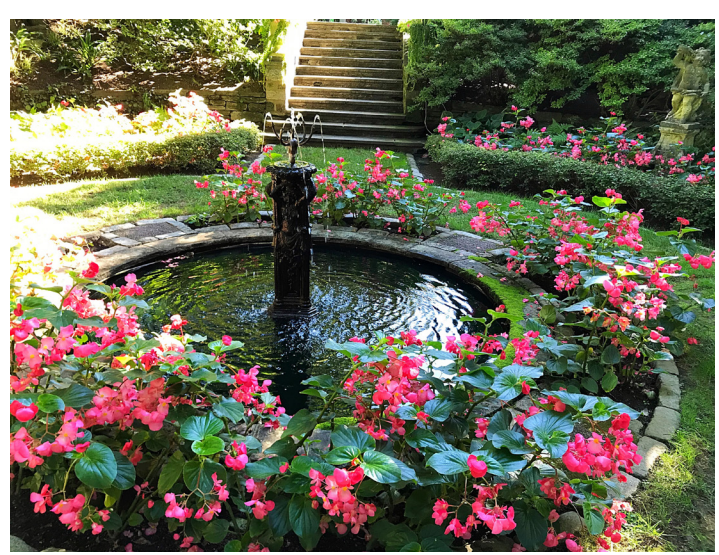
Pennsylvania Horticultural Society's Meadowbrook Farm.

carpooling, ridesharing and use of electric and renewable energy vehicles will be easy, practical and safe. Transportation choices will serve as viable alternatives to the personal automobile, and will make it even easier for residents, employees and visitors to travel around Abington, and from Abington to Philadelphia and other destinations in the metropolitan area. Sustainability and environmental resilience will feature prominently in the township's programs and policies, helping Abington adapt to a changing climate while serving as a sustainability and resilience leader, setting an example which other communities can learn from. Enhanced landscaping, greenery and aesthetic standards will reinforce Abington's visual attraction and sense of place.