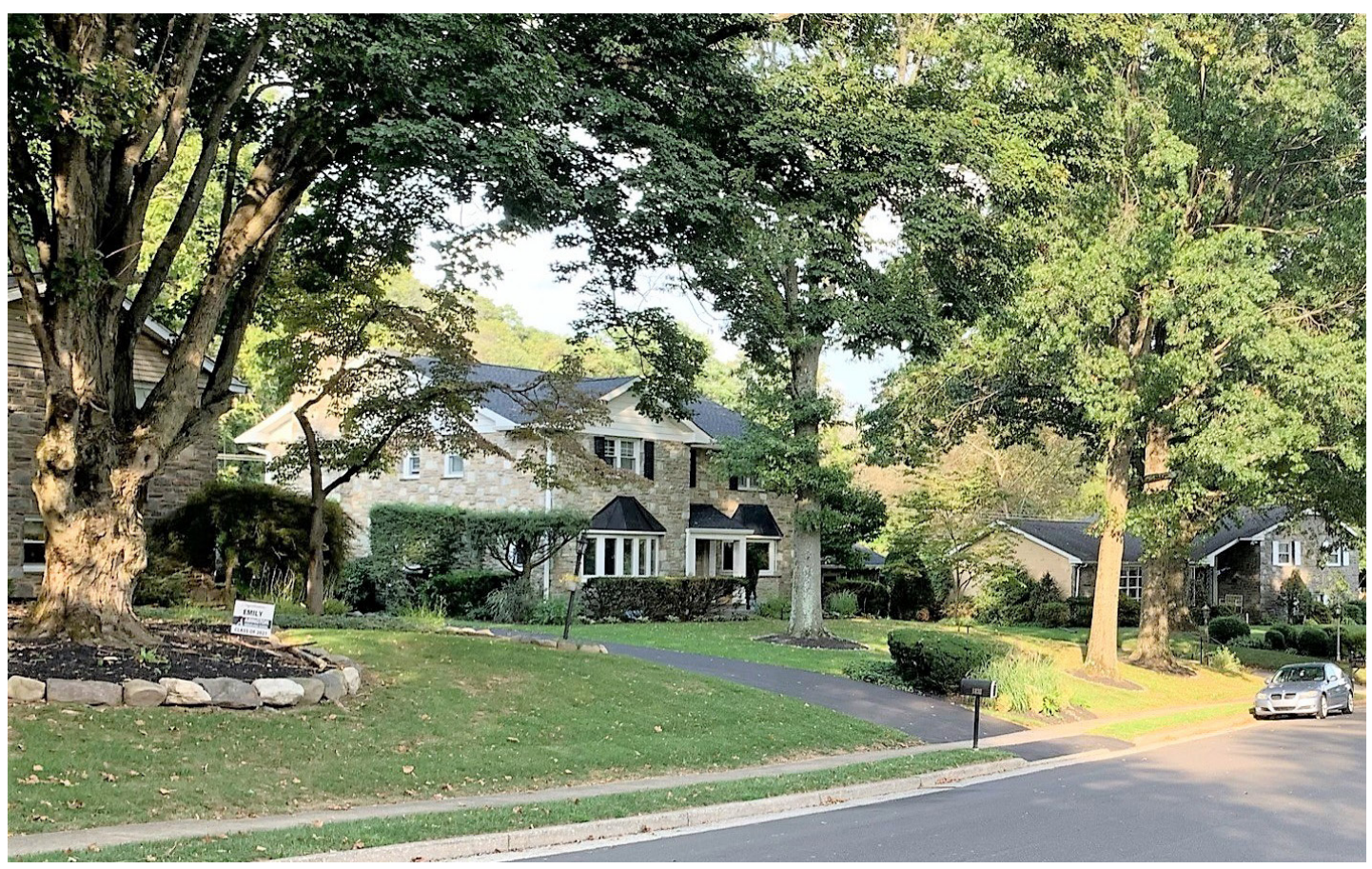
Residential\ neighborhood,\ Meadowbrook.