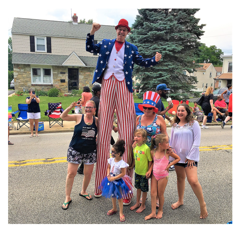
4th\ of\ July\ celebration,\ Glenside.

Desirable Residential Areas. A range of housing options will be available to a wide range of households of varying tastes and incomes, including homes that are affordable, of varying sizes and configurations, and historic homes that are well-preserved and demonstrate the well-maintained and historic nature of many of Abington's homes and residential neighborhoods. All neighborhoods will be safe, pedestrianand bicyclist-friendly, will include generous shade tree canopy and will have good access to parks and open space.