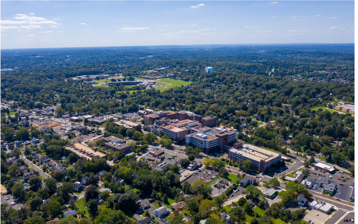
Abington Township vista (over Old York Road).