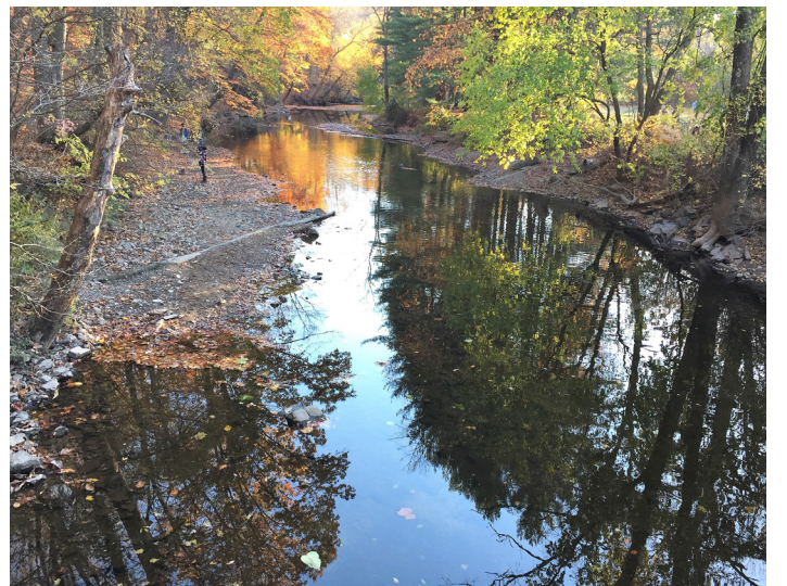
Pennypack Creek, Lorimer Park.