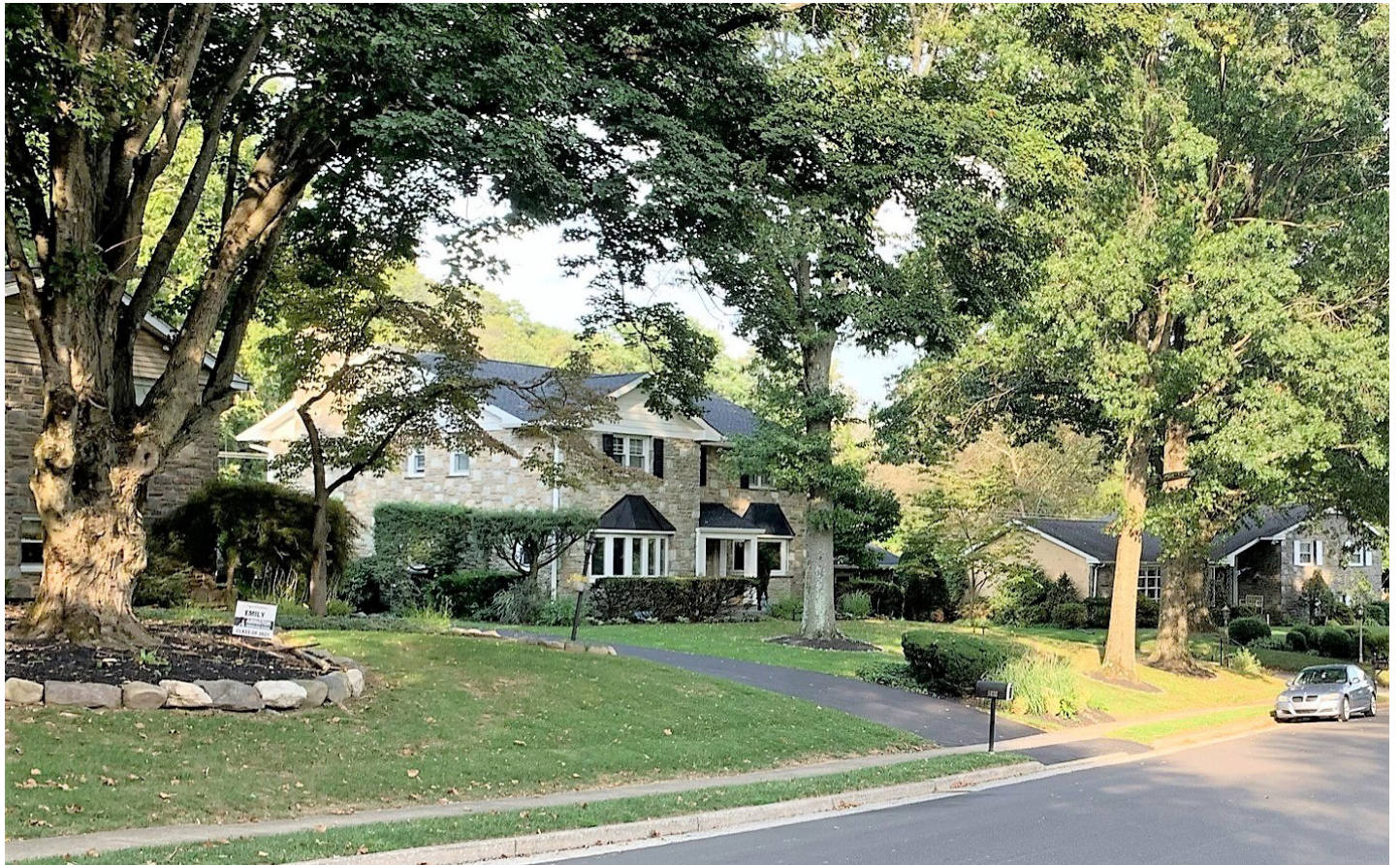
Residential neighborhood, Meadowbrook.