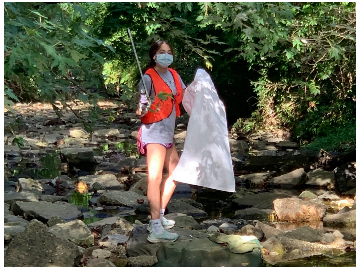
Sandy Run Creek cleanup, Roslyn Park.