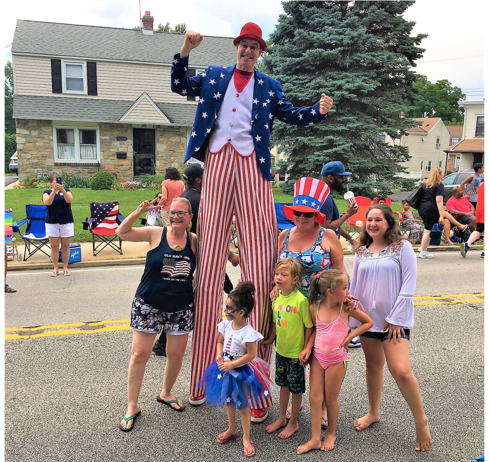
4th of July celebration, Glenside.

Desirable Residential Areas. A range of housing options will be available to a wide range of households of varying tastes and incomes, including homes that are affordable, of varying sizes and configurations, and historic homes that are well-preserved and demonstrate the well-maintained and historic nature of many of Abington's homes and residential neighborhoods. All neighborhoods will be safe, pedestrian- and bicyclist-friendly, will include generous shade tree canopy and will have good access to parks and open space.