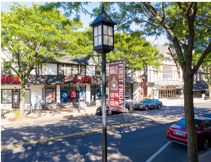
Keswick Village and Theater.