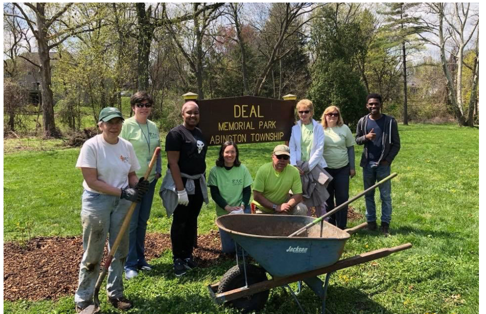
Tree City USA volunteer event.

Municipal government will be open and transparent, allowing all township residents to easily participate in and inform themselves about the processes and actions of the township’s elected and appointed officials. Municipal