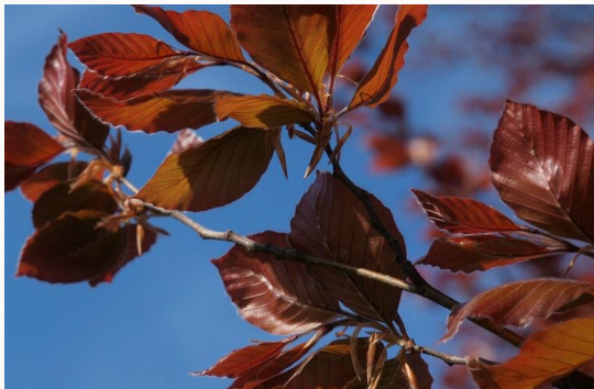
Copper Beech School heritage tree

Please complete this form and return with your donation. Thank you!