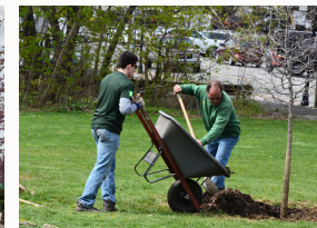
a tree planting crew