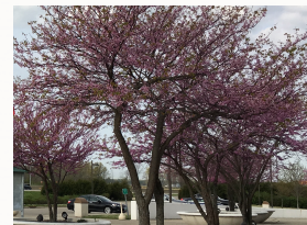
redbud trees in the spring

A donation of $50 supports the purchase of a healthy, native ornamental tree suitable for planting in small spaces. We plant the right tree in the right place, ensuring that trees and overhead wires can peacefully coexist. Fun facts: Redbud trees are pollinated by bees. Beautiful pink flowers grow from the branches and trunk before leaves appear each spring.