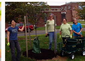
a tree care crew