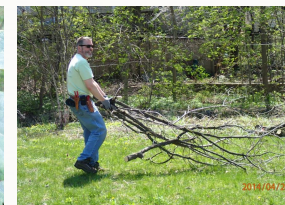
proper pruning through the years